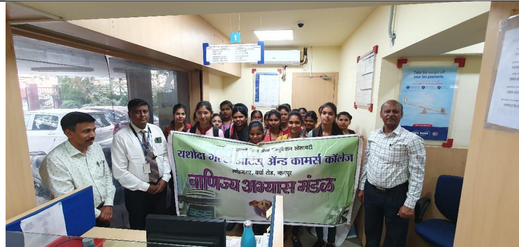
H D F C Bank