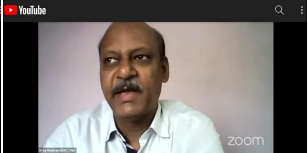
Webinar on Goal Setting & Content Writing