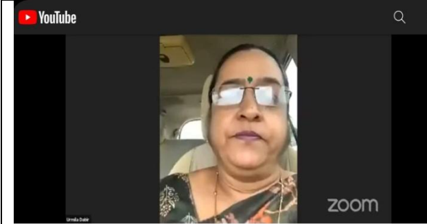
Webinar on Goal Setting & Content Writing