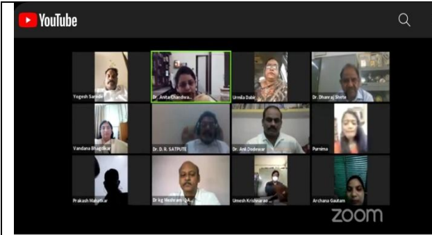
Webinar on Goal Setting & Content Writing