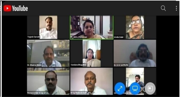
Webinar on Goal Setting & Content Writing